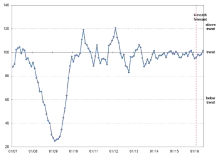
Chicago Business Activity Index

Visit our web-site at www.real.illinois.edu